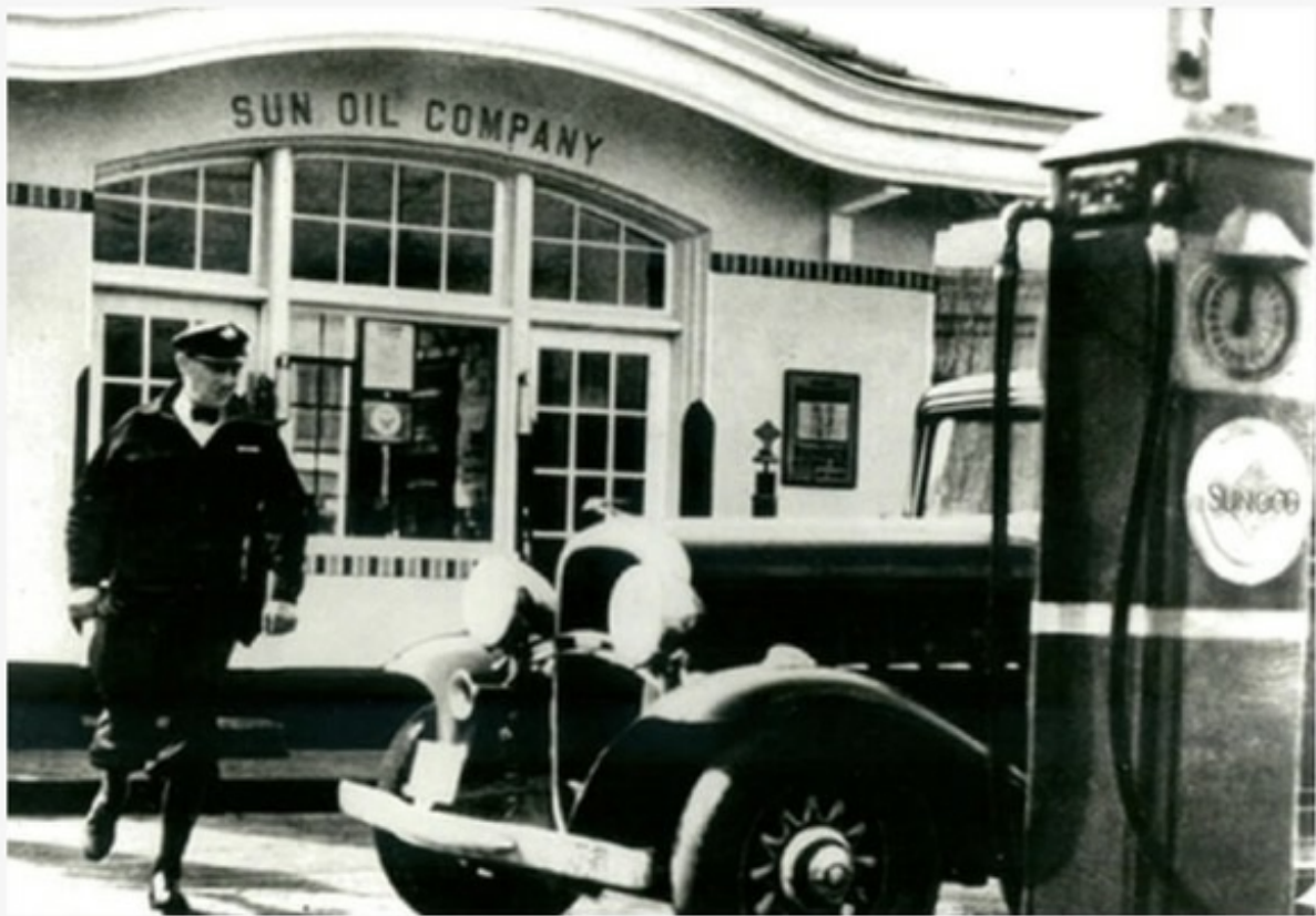
The first Sunoco location in Ardmore. Today, there are more than 5,800 Sunoco stations in the U.S.