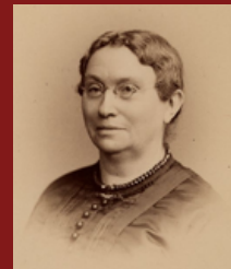
Dr. Hannah E. Myers Longshore Abolitionist, first woman physician in PA

Honoring a family of trailblazing women: