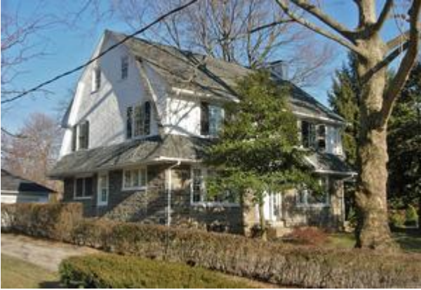
The old house (demolished c. 2006)

build a parking garage. Now they are building groups of row houses on smaller lots behind the garage.