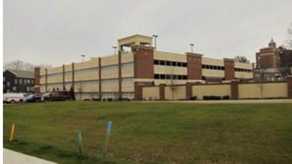
The garage (built 2008)