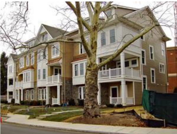
The new houses built (2010)

The March issue will have an announcement about our April Annual Meeting/Open House and the Election of Officers and Directors.