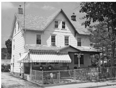
20-22 Holland Avenue in Ardmore. A twin scheduled for a teardown to make room for the expansion of a car dealership.