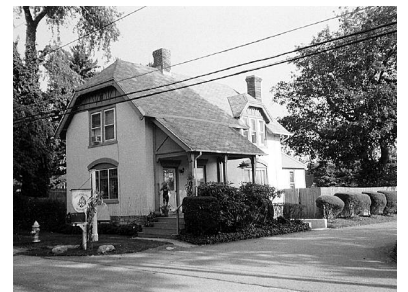
Kirkner house at 1601 Spring Mill Road (Philadelphia Country Club) in Gladwyne. A 19th century country cottage scheduled for a teardown to make space for an expanded parking lot.