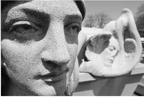
The William Warner monument located at Laurel Hill Cemetery. It was sculptured by Alexander Milne Calder who did all of the sculpture on city hall (including William Penn) and who is buried at West Laurel Hill Cemetery.

Sunday, October 29th at 5:02pm (at sundown)