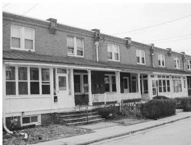
Central Avenue in Bryn Mawr. Row houses on the west side of the Avenue. Most were demolished over the summer as part of Main Line Health’s future expansion.