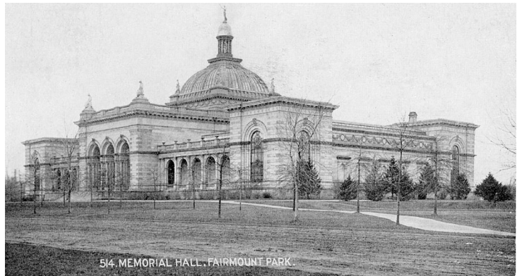
Memorial Hall, the centerpiece of the Centennial Exposition

Free admission and complimentary refreshments.