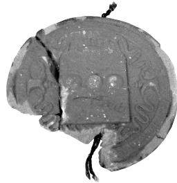
Obverse side of the “Seal” from the 1701 “Charter of Privileges”

As a community, we're proud of our Quaker roots and William Penn's influence in molding our form of government. We're fortunate to have in our Archive Collection source materials that relate to William Penn. Two Penn memorabilia items in our collection are: