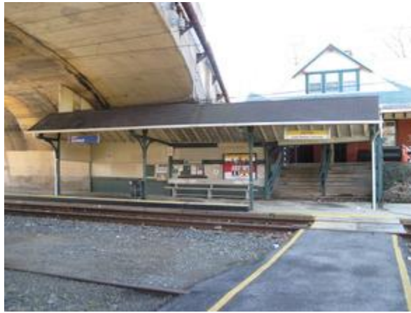
View of the shed before demolition