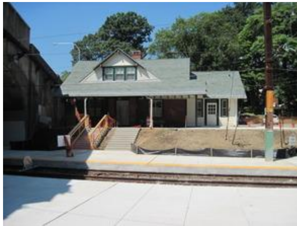
View of the platform after the demolition of the shed